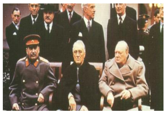
Source A. A publicity photograph of the Big Three at the Yalta Conference, February 1945.

1. Source A shows that the Yalta Conference was a success. How do you know? Explain your answer by using Source A and your own contextual knowledge(4)