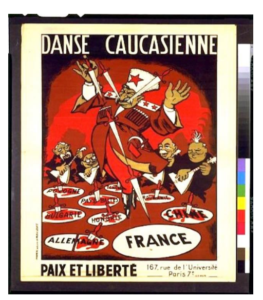
Source A.A French cartoon made in 1951 commenting on Stalin's takeover of Eastern Europe.

4. Source A opposes the Soviet Union. How do you know? (4)