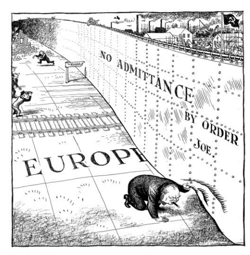
Source A. A cartoon by Leslie Illingworth from the Daily Mail, 6<sup>th</sup> March 1946

2. Study Source A. Source A is critical of the USSR. How do you know? Explain your answer using Source A and your contextual knowledge(4)