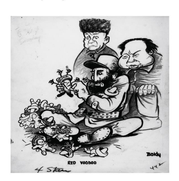
Source A. A cartoon drawn by the American cartoonist Clifford Baldowski and published in the Atlanta Journal newspaper in

1. Source A is critical of Castro and Cuba. How do you know? Explain your answer using Source A and your contextual knowledge.