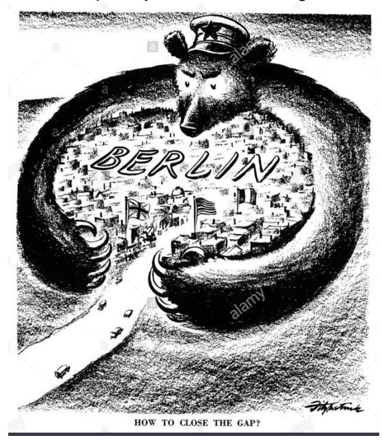
Source A. A cartoon by the American cartoonist D.R. Fitzpatrick; Russia is often depicted as a bear.

3. Study Source A. Source A is critical of the actions of the USSR. How do you know? Explain your answer using Source A and your contextual knowledge(4)